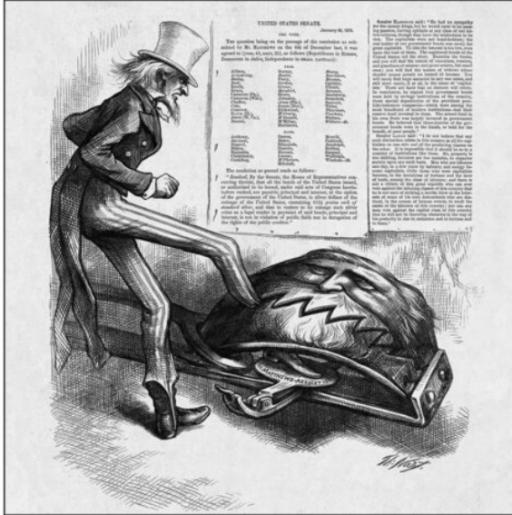
THE FIRST STEP TOWARD NATIONAL BANKRUPTCY.